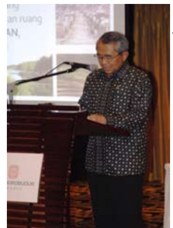
The Minister of Public Works

The Vision provides guidance for province and district governments to implement the Governors’ commitment to conservation in Sumatra. The Ecosystem Vision maps areas for protection and restoration based on an assessment of critical biodiversity and habitat.