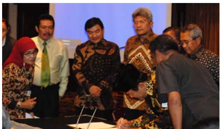
10 Sumatra Governors and 4 Ministers signed the Roadmap document to rescuing ecosystem of Sumatra

The Roadmap Action Plan also outlines measures to be taken to avoid additional ecosystem degradation through restoration of critical areas, sustainable management of areas in good condition and development of incentive mechanisms.